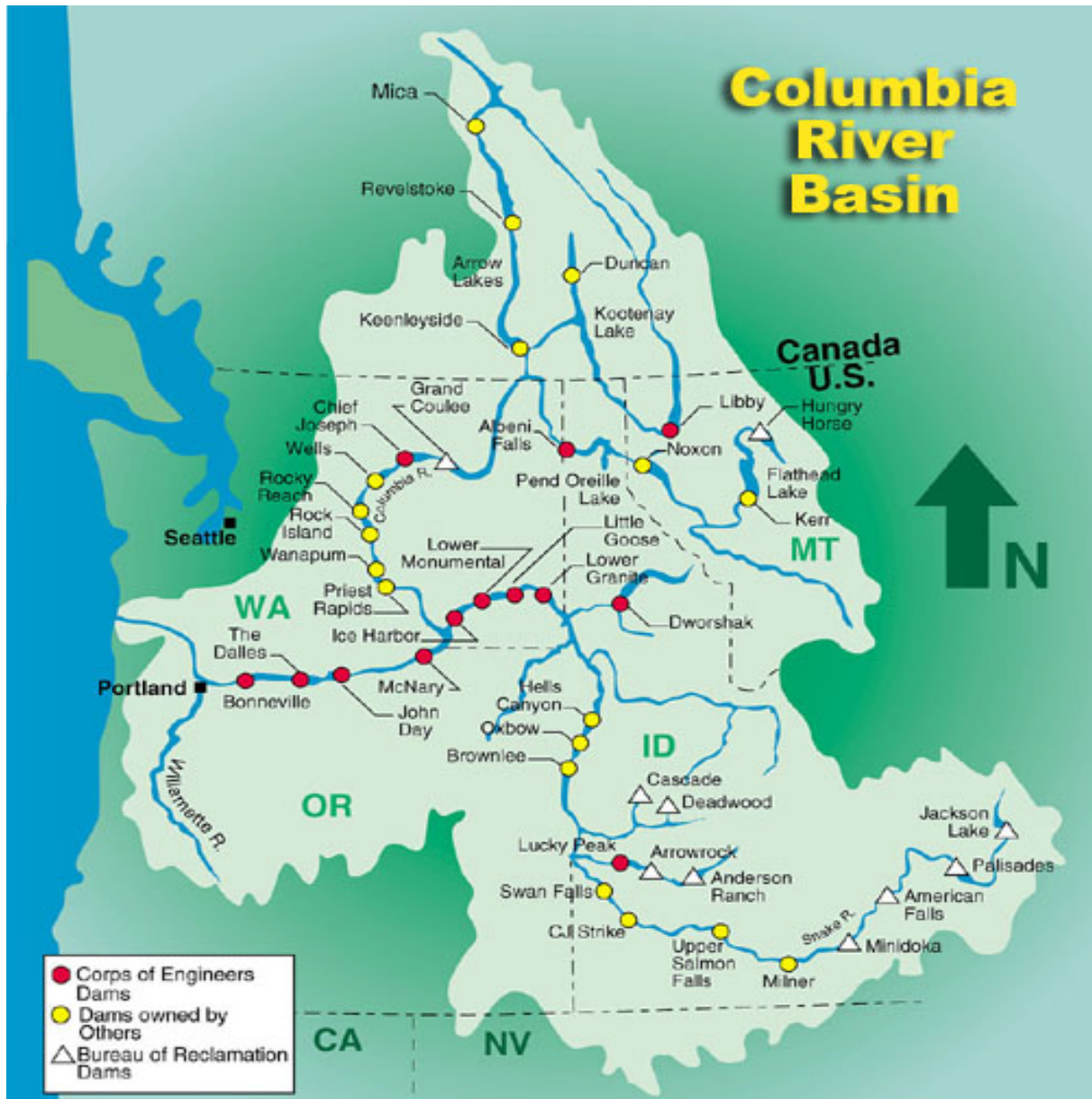
Appendix 2: Columbia River Basin Hydroelectric Projects