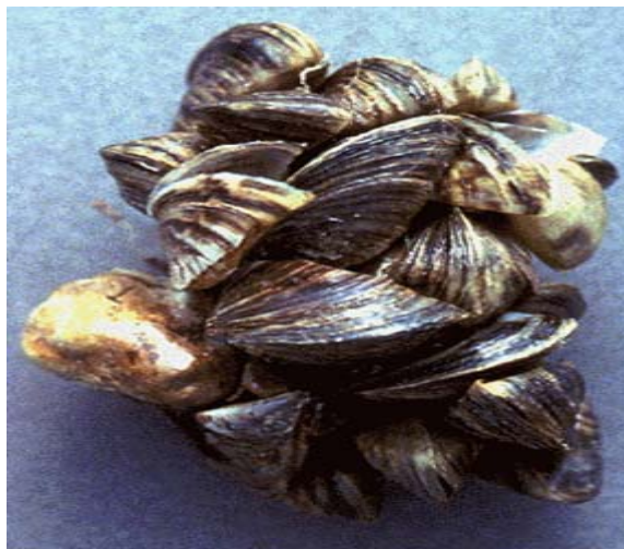
Zebra Mussel ( Dreissena polymorpha)