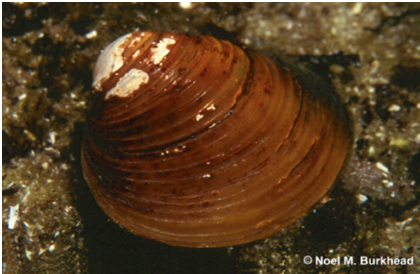
Asian Clam ( Corbicula fluminea )

An Environmental Assessment (EA) is generally an initial screening analysis and is usually less costly than the more detailed analysis typical of an Environmental Impact Statement (EIS). The permitting process for a zebra mussel mitigation strategy using a biocide could require a significant time commitment. The numerous environmental issues in the CRB would almost certainly require an EIS before any zebra mussel mitigation activity could be implemented.