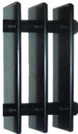
Figure 2: Section of trash rack.

square feet. The total square footage for both powerhouses would be approximately 136,935 square feet (Darland 2005). A section of a trash rack is pictured below ( Figure 2 ). The cost for ablative anti-fouling paint ranges from $10-$15 per square foot. At a cost of $12.50 per square foot, the cost of materials for repainting the trash racks would be $1,711,688. In addition, the cost to remove, sandblast, paint, and re-install Bonneville's 329 trash racks would be an estimated $1,800,000 (Darland, 2005). As a result, the total cost for an antifouling paint treatment, including materials and labor, is about $3,500,000. Obviously, there are numerous variables that could affect trash rack painting costs, including paint cost, other routine maintenance requirements, other screens and conduits requiring treatment, etc. For example, trash racks at Bonneville are removed for inspection and repaired about every 5 years; if painting could be stretched out over time and coordinated with this maintenance cycle, significant savings would be realized. However, initial paint applications would likely need to be applied in a shorter time frame.